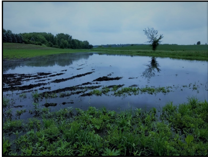
Wetland Banking Site