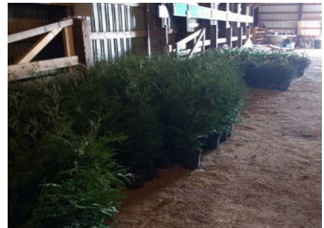
Conservation Tree Stock