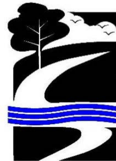
Logo for 2018 and beyond