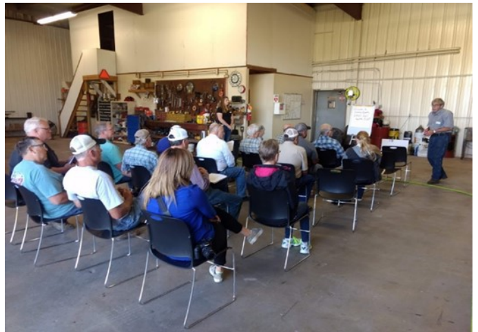
Pictures from Soil Health Plot Tour held at Farmamerica in August 2019.