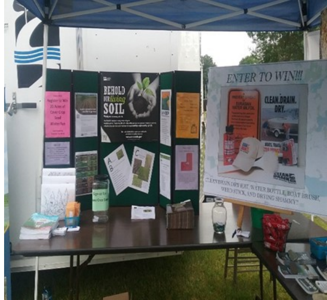
Top Left: New Richland Farm & City Days—Mark A bag of Cover Crop Seed was given away to an area Landowner.